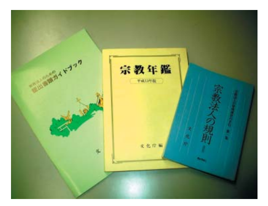
The "Religion Yearbook" and other publications

In addition to collecting statistical data concerning religion, the Agency for Cultural Affairs also compiles and publishes the annual "Religion Yearbook" and other publications.